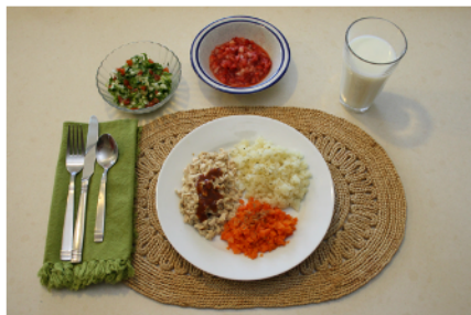
1/4" Cut Food