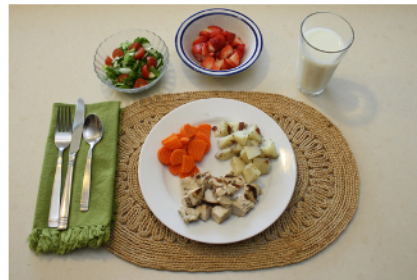
1" Cut Food