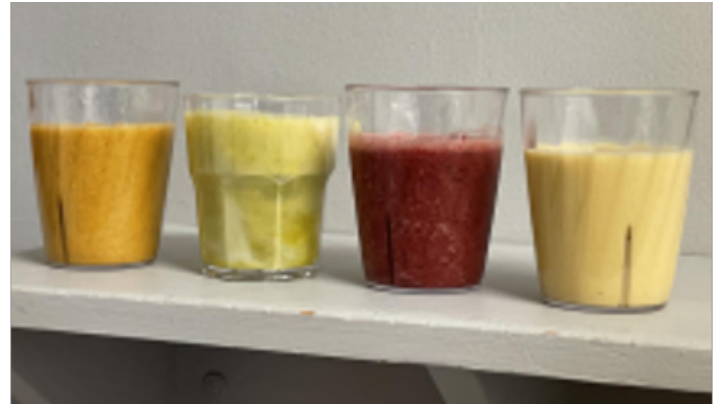
Pictured above: Thin (normal), Nectar (thickened), Honey (thickened), Pudding (thickened)